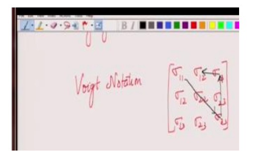
Figure 3: The arrow directions shows the sequence in which the six independent components of stress matrix are written in Voigt notation

Due to the symmetry of stress matrix, it has got only six independent components. So, we can also think of a 6×1 vector formed by the six independent components. The sequence in which they are written is shown in Figure 3.