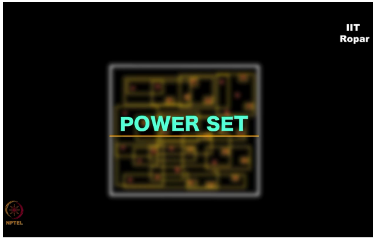
What is more beautiful about power set, is it relationship with a binomial theorem, let us