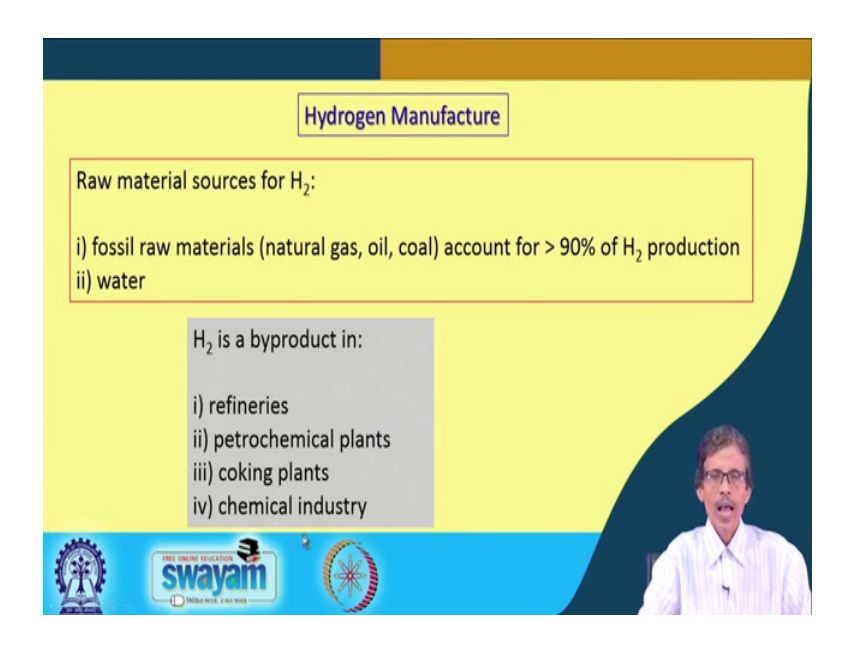
So, how we can utilize these; that means the hydrogen manufacture how we can manufacture these; that means, whether we can have the petrochemical process or the simple electrolysis of water. So, as we have seen just now that we can have the water